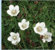
Grass of Parnassus

Enjoy nature as well as history along the walk - look out for plants such as bog asphodel and grass of Parnassus.