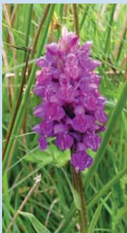
Northern Marsh Orchid

The beach is a shell collector's paradise, with many types of shells washed up here after winter storms. Look out for the very rare canoe shell - this is the only beach in Orkney where you can find it. If you prefer birds, look out for terns and skuas in the summer or waders and divers in the winter.