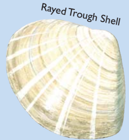
Rayed Trough Shell

'Ortie' was built as a model crofting township in the 19th century. It was designed as a 'closs' (narrow passage between the buildings) and the land was farmed in strips. The township thrived and in 1871 there were 15 crofts in the township. The population was about 70 people at its peak. It became derelict in 1876.