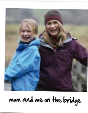
mum and me on the bridge