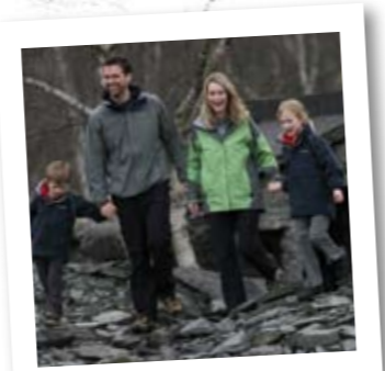
near the old slate mine