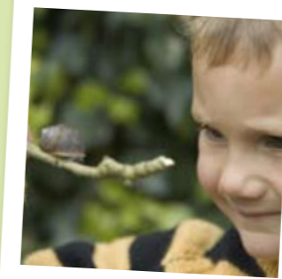
make new friends!