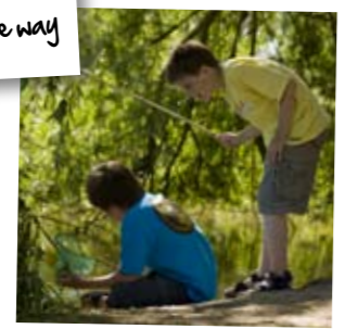
a new discovery in the river!