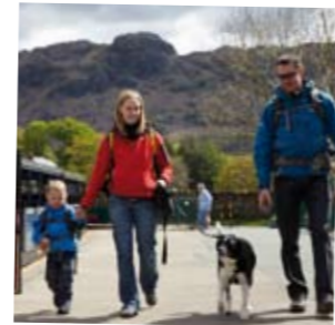
at the train station