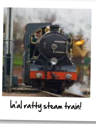
la'l ratty steam train!