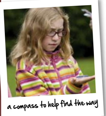
a compass to help find the way