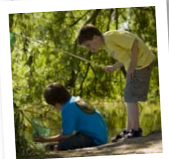
a new discovery in the river!