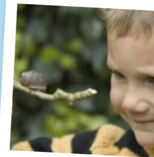
make new friends!