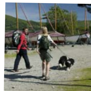
lots of sail boats at ullswater