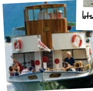
a "steamer" on ullswater

This though is just an illusion and Place Fell is perfect for families with a desire for adventure!