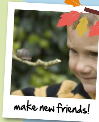
make new friends!