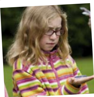
a compass to help find the way