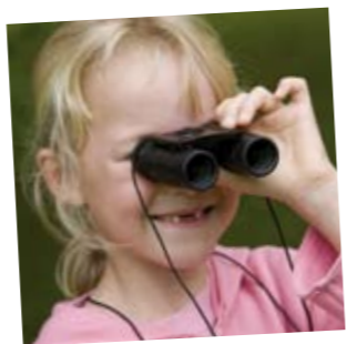
see for miles!

Once you have finished exploring the caves the little ones can complete the shorter green route and older ones can carry on along the blue route before meeting up back at the car park.