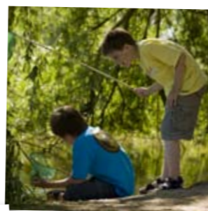
a new discovery in the river!